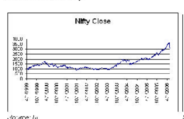
Growth trend in Nifty

The exaggerated exuberance driven by excess liquidity led to unsustainable leveraged positions in the Indian market. Also interest rates in the US have been steadily climbing up changing the risk return profile of India and finally triggered the fall in the market. At the first instance when the FII turned sellers the leveraged players could not match up to the selling, and ended in large scale correction.